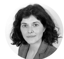
Mara Airoidi Government Outcomes Lab